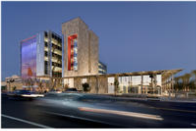
View of council chamber and courtyard at night - Photo Credit: SmithGroupJJR