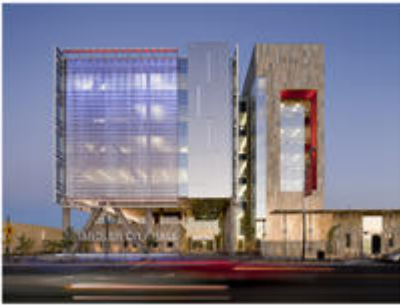
View of office tower from west