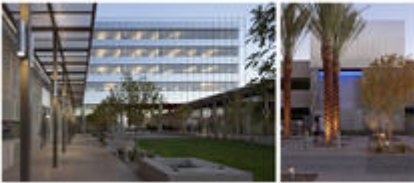
Views of courtyard and cooling tower water feature

As with any facility located in a desert region, water conservation is critical. The Chandler City Hall complex has taken a comprehensive approach to reducing potable water use. Both interior and exterior strategies were employed. The interior approach utilizes low-flow water-conserving fixtures, while the exterior approach utilizes high-efficiency drip irrigation and low-water-use native plants. The project also focused on the process side by capturing “blow-down” water from the operation of the cooling towers and the condensate water from the HVAC systems. Large volumes of water normally get dumped down the sewer when employing cooling towers. This water is non-chemically treated and reclaimed for the purpose of supplementing irrigation and waste conveyance. During the summer months, there is an excess of water generated, so no potable water is being used for interior or exterior systems. Less water is generated during the winter months, which requires some potable water.