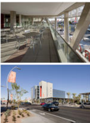
Views of open mezzanine and street frontage