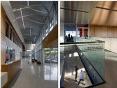
First level public lobby space and second level balcony - Photo Credit: SmithGroupJJR