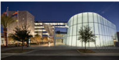
View looking at council chambers and office tower from southeast - Photo Credit: SmithGroupJJR