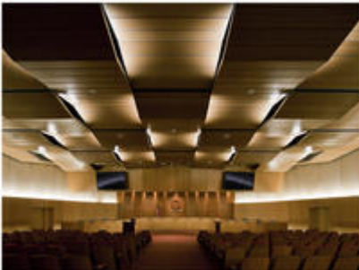
Council Chambers