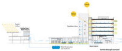
Building section and sustainable courtyard diagram - Photo Credit: SmithGroupJJR

The City Hall is situated over two city blocks bisected by Chicago Avenue. The office building itself is situated at the northern boundary of the site and is lifted above the ground plane, creating a breezeway at the north end of the courtyard. These gaps between blocks at the