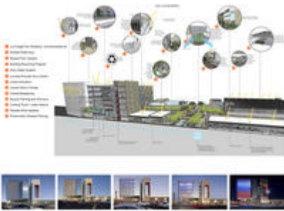
Overall sustainability diagram and images of "Turbulent Shade" Public Art

From an environmental and ecological standpoint, the design responds to the harsh desert climate and at the same time provides for appropriate outdoor spaces that introduced much-needed green space back to the heart of the downtown. Pushing the project footprint out to the site edges allowed for the design of a central courtyard that took advantage of shaded walkways and landscaping, channeling prevailing winds and evaporative cooling from a central water feature to temper the environment.