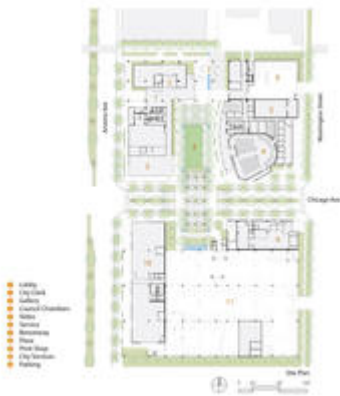
Site plan and first level