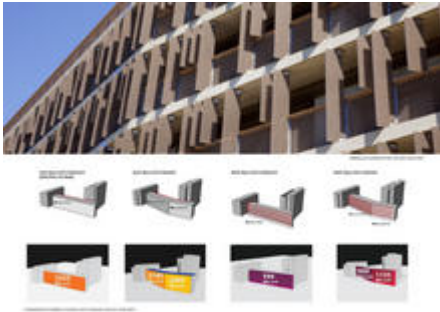
Comparison of energy savings with different shading and massing options

The building functions as a selective environmental filter, enhancing the best components of the regional climate to address heating, cooling, and ventilation needs, while rejecting the elements that jeopardize occupant comfort. The coastal location experiences highly regular afternoon breezes. To optimize the cooling effect, the building mass and window openings were shaped and sized to best capture the breezes based on landscape-scale CFD modeling. To ensure occupant comfort, an easily ventilated single-loaded corridor scheme was generated and a scale model was wind-tunnel tested, with the resulting pressure differentials on the envelope used to inform the interior layouts and ensure adequate interior ventilation.