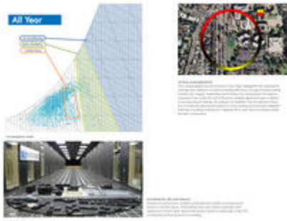
Psychrometric, wind and solar analysis informed the design