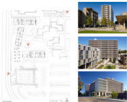
Site Plan and views