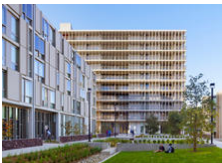
View of courtyard and north tower