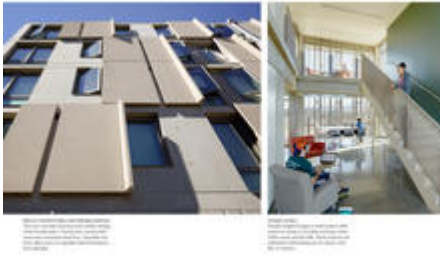
The cast-concrete structure from the outside, and a double-height lounge

The most significant reduction of energy on this project comes from the elimination of air conditioning based on scientific validation of the effectiveness of the proposed design. Both building mass and envelope are designed to manage solar gain and nighttime cooling and to ensure effective natural ventilation.