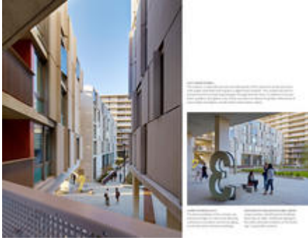
Outdoor circulation promotes social interaction