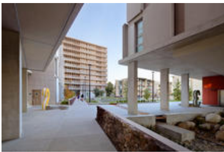
View entering plaza from the south