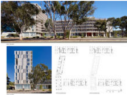
Plans and elevations - Photo Credit: Tim Griffith