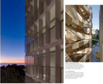
Materials and Construction

Materials used in the building are robust and long-lasting, with an 80-year life span. In addition, most surfaces are unfinished, eliminating the need for carpet, vinyl tile, or mastics.