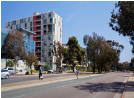
View looking south on Torrey Pines Road