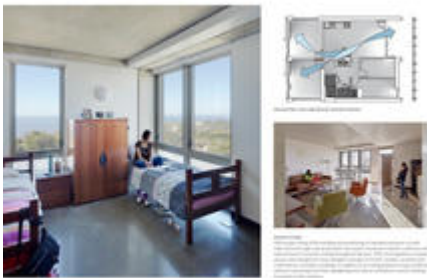
90% of all regularly occupied spaces receive daylight coverage of 25 foot-candles

The design maximizes the occupants' exposure to the best qualities of their environment. The location, on a bluff located above the Pacific Ocean, offers remarkable views as well as ready access to refreshing onshore breezes. The building is situated to provide expansive views of the ocean and mountains from all interior spaces, and from exterior walkways and the large roof terrace, which have become popular informal community gathering spaces.