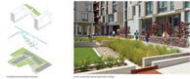
Stormwater management and habitat creation