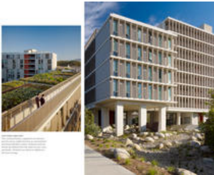
Bioremediation via green roof and bioswales

Rain events at UC San Diego are infrequent, but are often dramatic downpours that produce high volumes of runoff which, from this position atop the Pacific coastal bluffs, cause erosion to the fragile coastal scrub arroyos, a particularly threatened ecosystem. To counter this damage, the apartments use the natural slope of the site to provide limited natural infiltration, reducing the quantity of water and increasing the quality of the water released into the ocean. Water from the roof and a nearby parking lot is channeled and daylight through retention basins and bioswales.