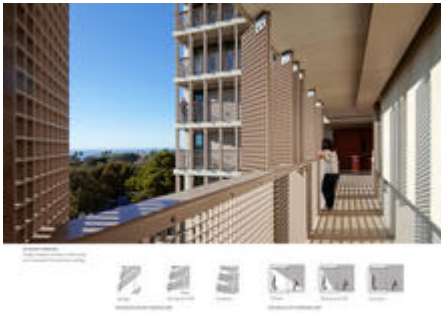
Single loaded corridors for passive cooling