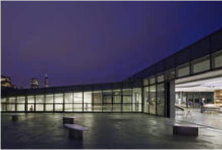
The outdoor Bay

The Embarcadero is a thriving public promenade that lines San Francisco Bay, but historic Piers 15 & 17, sitting mid-way between the Ferry Building and Fisherman's Wharf, had fallen into disrepair and created a dormant stretch along an otherwise vibrant waterfront. The Exploratorium project transformed this decaying and inaccessible piece of the Embarcadero into a dynamic, contemporary interpretation of an active waterfront by removing much of the concrete parking deck between the two piers and creating a major new public plaza full of life, a bay history walk, and hands-on science exhibits.