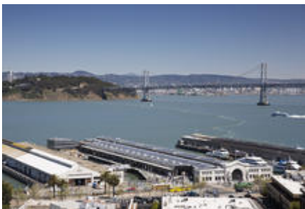
Aerial view looking East showing 1.3 MW PV Array