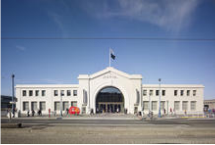
Historic bulkhead from the Embarcadero