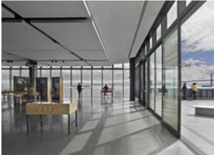
The Bay Observatory has indoor and outdoor space for events

The Exploratorium describes themselves as a Museum of Art, Science, and Perception, and they wanted their new home to demonstrate that and spark a conversation with their visitors. They committed to a Net Zero Energy (NZE) goal in 2004, long before there were any precedents for buildings of this size or program, and used a range of old and new strategies toward that goal. The existing historic pier offered great daylight, thermal mass and solar orientation. The bay water below was a natural for cooling the building using an innovative baywater radiant cooling system. The 800' long roof accommodated a 1.3 MW PV array to power the all-electric building. Many of the science exhibits that make up the heart of the museum have significant energy demand, such as generating steam. We worked closely with their in-house exhibit designers to monitor and then optimize many of these exhibits. Detailed energy monitoring throughout the building has enabled the Exploratorium staff to continually refine the design and operation of their exhibits, and to build a culture of ever improving performance based on actual data. The public energy monitoring displays and baywater cooling machine room have become favorite exhibits for visitors in their own right.