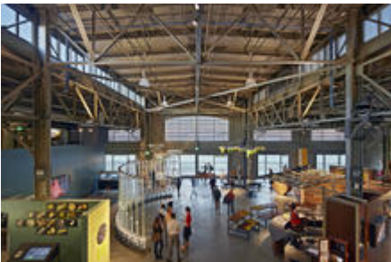
The East Gallery