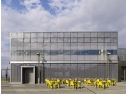
The new Bay Observatory - Photo Credit: Photo by Bruce Damonte