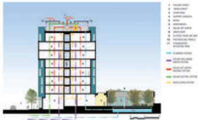
Measure 5 - First Image - Photo Credit: LMS Architects