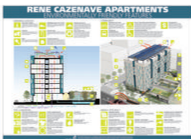
Measure 1 - First Image - Photo Credit: LMS Architects