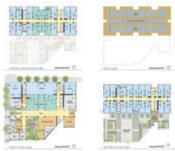
Additional Images - First Image - Photo Credit: LMS Architects