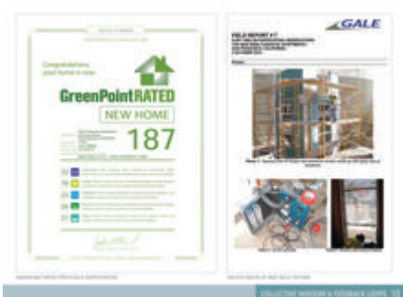
Measure 10 - First Image - Photo Credit: Build-It-Green + Gale Associates

Several strategies were used to model and evaluate the performance of the Rene Cazenave Apartments in addition to the design and construction tracking under the GreenPoint rating system commonly used for residential buildings in the Bay Area.