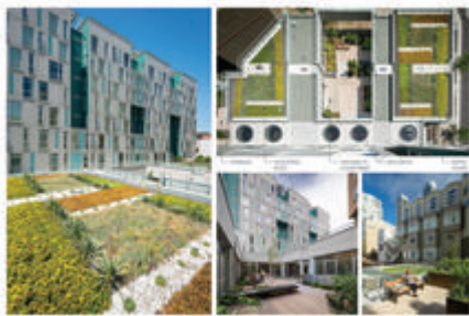
Measure 3 - Second Image

Located in a very urban setting near downtown San Francisco, the Transbay redevelopment plan will introduce a new ecology to this former commercial district impacted by freeway off-ramps. New parks, landscaped plazas, and green roofs will transform the area. Surrounding the RCA site, a new under-ramp park will provide recreational and landscape features.