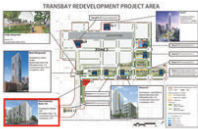
Measure 2 - First Image