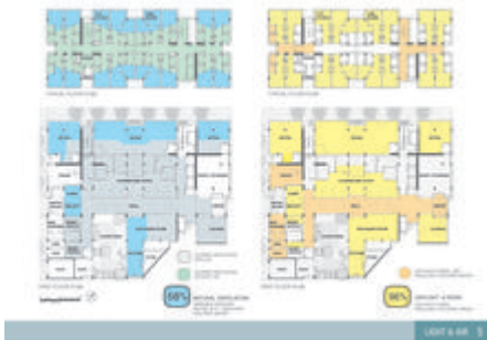
Measure 5 - Second Image - Photo Credit: LMS Architects

Comfortable and healthy living spaces are a key component of residences for formerly chronically homeless individuals who typically have physical disabilities.