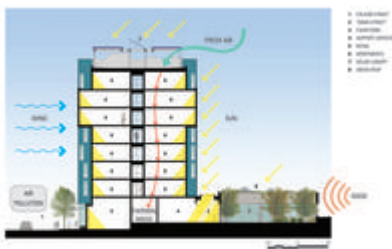
Measure 4 - Second Image - Photo Credit: LMS Architects

The San Francisco microclimate at the Transbay project site is moderate, sunny, and relatively fog free. Prevailing breezes are generally from the northwest. Solar exposure is good due to the limited height of structures to the south of the site. At the same time, its proximity to Bay Bridge freeway off-ramps contributes to poor particulate air quality up to approximately 30 feet above grade.