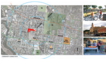
Community Connectivity

The project provides a model for community connectivity of diverse populations at the local scale, while offering a replicable solution to the growing housing crisis for adults with autism at the national scale.