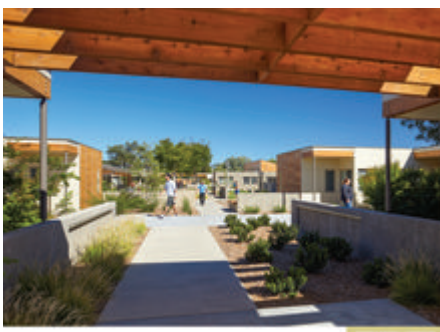
West Entry Threshold from the farm looking towards the Commons

The materials and construction systems of the Sweetwater Spectrum Community were selected with special consideration toward health, resource-efficiency, and the specific needs of the residents. Individuals with autism spectrum disorder can experience heightened sensitivity to a variety of environmental factors, including visual, thermal, auditory, social, and