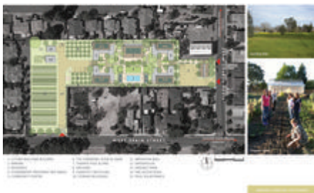
Site Plan for Sweetwater Spectrum Community & Farm - Photo Credit: LMS Architects + Deirdre Sheerin