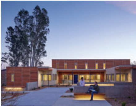
Entry Courtyard At Residence

Sweetwater Spectrum is a new national model for supportive housing for adults with autism, offering life with purpose and dignity. Created to address a growing housing crisis for adults with autism, this new community for sixteen residents integrates autism spectrum design, universal design, and sustainable design strategies.