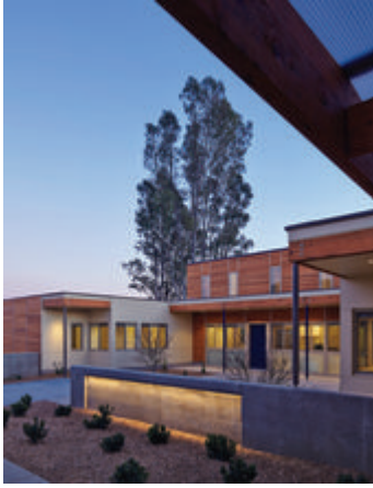
Entry Courtyard at Residence