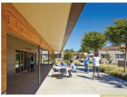
Community Center and Commons at the heart of the site

Located within the fertile Sonoma Valley, the open mid-block site is part of a suburban residential area and was previously slated for the development of 14 single-family residential units. The Sweetwater Spectrum community preserves the important community midblock