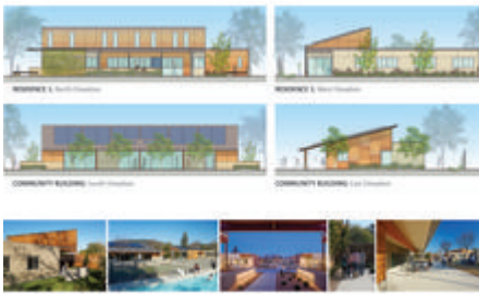
Building Elevations - simple building forms, materials and colors create a calm community environment