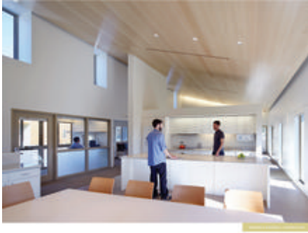
Typical residence living area with balanced daylight, operable windows, and acoustic ceiling with sustainably harvested wood panels.