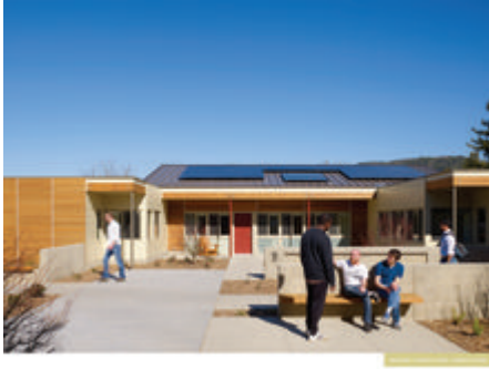
Entry Courtyard at Residence with solar thermal and photovoltaic panels

The project exceeds the AIA's 2030 Commitment for energy reduction, using 88% less energy than baseline including on-site renewable energy contribution.