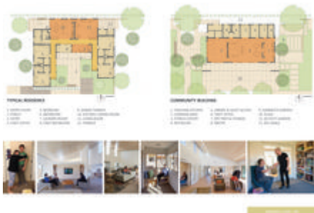
Residence and Community Building Plans - Each space has a balance of daylight and natural ventilation.

The design emphasizes simple solutions that maximize energy efficiency, resident comfort, and connections to nature while reducing first cost and long-term maintenance.