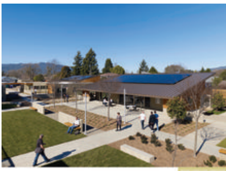
Community Center and Commons - Photo Credit: Tim Griffith